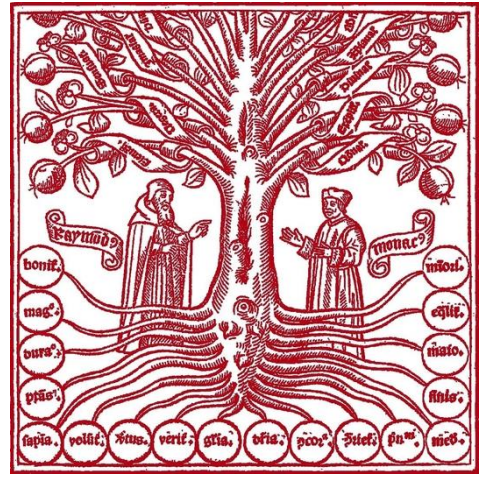
Arbor Scientiae (1295)

How to combine elements of thinking, elements of language?