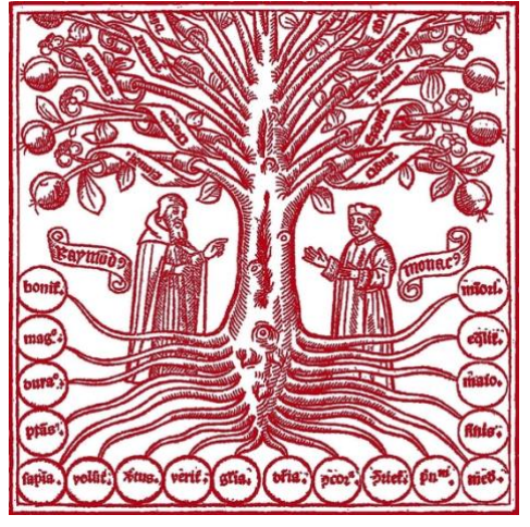
Arbor Scientiae (1295)

How to combine elements of thinking, elements of language?