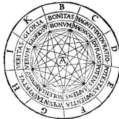
Ars magna generalis ultima (1305)

Mission statement: ‘Digital transformation’ is the expression that has been formulated to describe our age, however, we are starting to see that it is the human being that should be in the forefront of current development trends; no successful industrial revolution will be accomplished without bearing in mind basic human values, such as equality and responsibility.